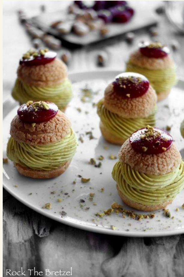
Rock The Bretzel